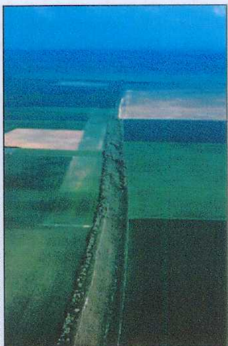
The dry chalkland ridge has provided a transport corridor for thousands of years. Its strategic importance is demonstrated in the four great Anglo Saxon dykes that lie across it. The greatest of these, the Devil's Dyke, Cambridgeshire, is seven miles long, six metres high and four metres wide.